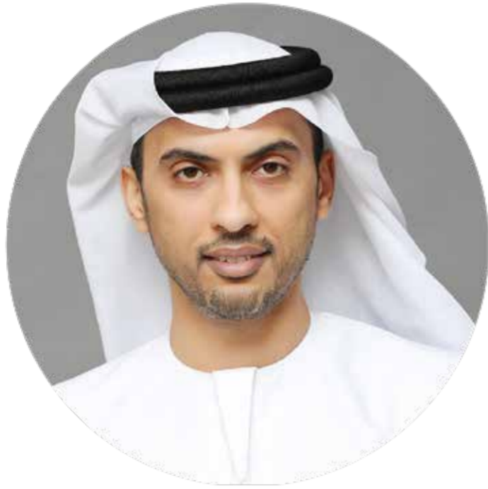
H.E. Wesam Lootah, CEO of the Smart Dubai Government Establishment